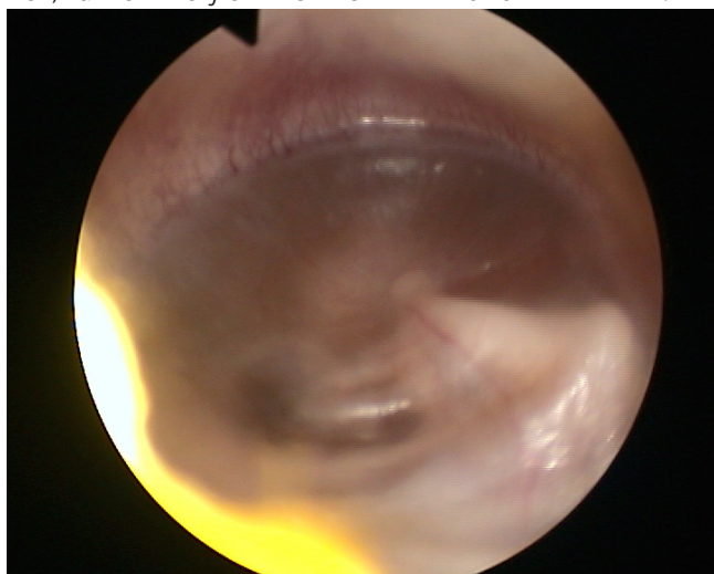
Figure 2. Bulging hyperemic tympanic membrane is revealed on the otoscopic examination (left ear).

It is vital to detect the possible reason for facial nerve paralysis when an otologic disorder is present. The clinical aspects of the FNP and the treatment modalities will be different when chronic otitis media co-exists [10]. In our study, all of the children were admitted with progressive symptoms of acute otitis media and suffered from severe ear pain despite of medical therapy. Otitoscopic findings of the patients—bulging hyperemic tympanic membrane and air-bubble levels (Figure 2)—show a correlation with acute otitis media. Only one patient had micro perforations on the tympanic membrane due to acute suppuration, but no history of chronic otitis media was determined.